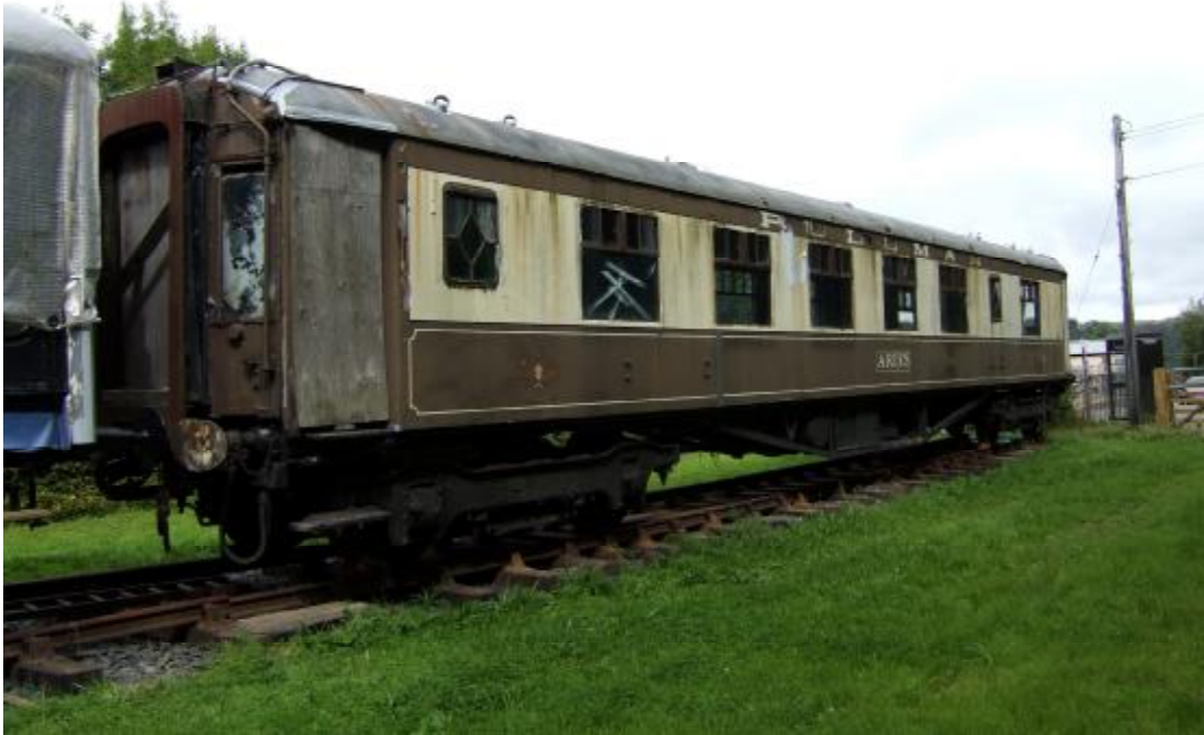
Both Images Pat O'Connor