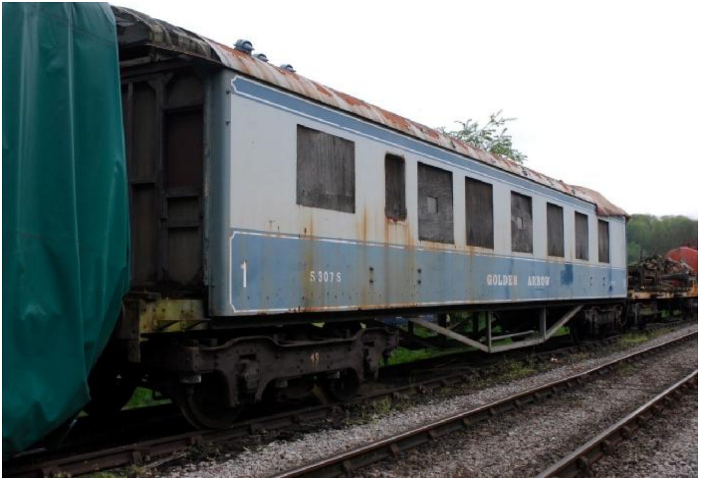
Pullman car CARINA May 2006 at Pickering Siding North Yorkshire Moors Railway